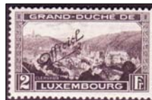
PLATE & PRINTING VARIETIES