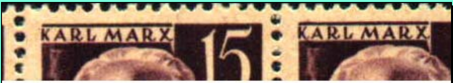
Karl Marx pair with error "no hook to "K"" (left) and normal (right)

(d) Saar (1945-47) listed separately with Saar